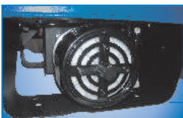
Positive displacement, motor-driven gear pump offers a continuous pulse free output.

D4-e units feature one mechanical relief valve or optional pneumatic relief valve.