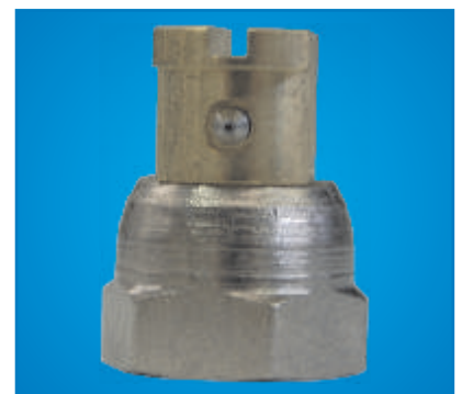
Single Orifice 90°

For more information visit www.valcomelton.com , or contact your local representative.