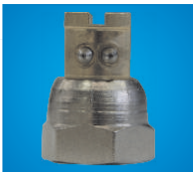
Dual Orifice 90° (15° Spread)