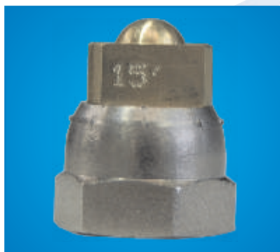
Dome Multi Orifice Nozzle