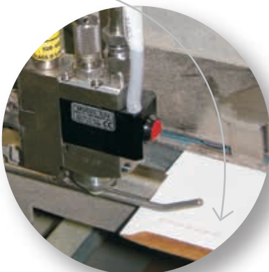
524 Valve applying dots on a folder gluer