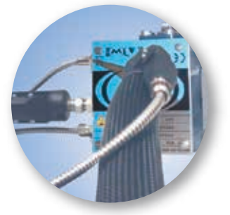
Plate for heat insulation creates a uniform thermal profile.

Multiple hose ports available to customize hot melt supply.