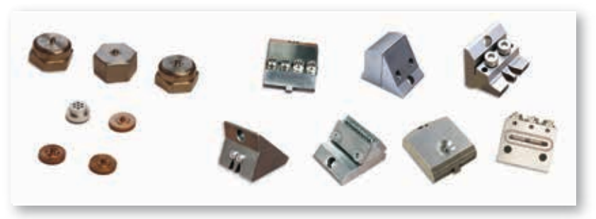
Choose Your Tip