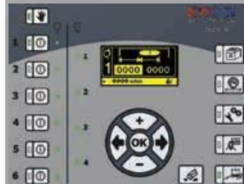
Pattern | Display