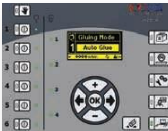
Auto Glue Mode