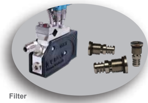
Integrated filter retains contaminants and mantains adhesive quality.