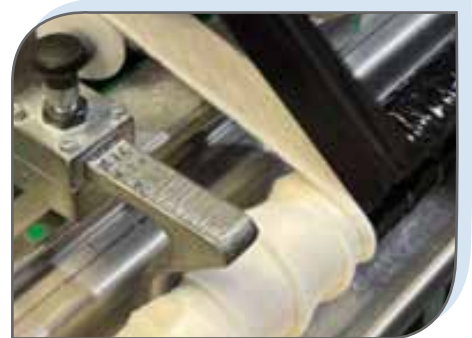
Nomex® insulation delivers outstanding thermal efficiency, maintaining consistent heat

Our Thermacore hot melt hoses are designed and manufactured in-house with top-quality materials for maximum performance. With advanced insulation, energy-saving features, and durable construction, they reduce downtime, improve precision and deliver long-lasting reliability. Switch to Thermacore for more efficient and productive operations.