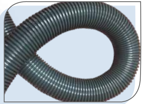
Maximum flexibility. Designed for demanding applications, ensuring ease of installation and durability.